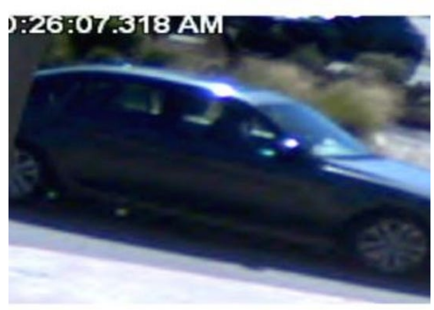
Editat Rigee of Robbic cal Dierprantmed nit) the robbery of the Wild Horse Pass Casino in Chandler.